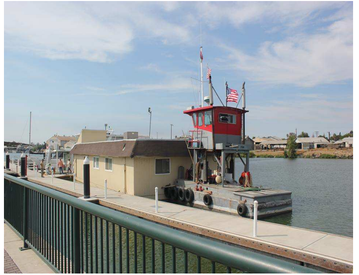
Our new home Stockton Downtown Marina September 2014