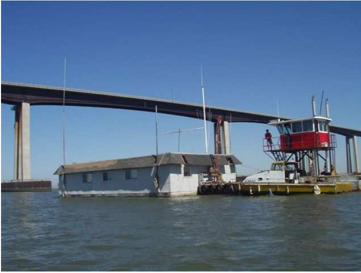
Owl Harbor Marina to San Joaquin Yacht Harbor June 2006