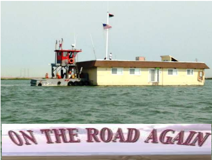
Going up the San Joaquin River September 2014